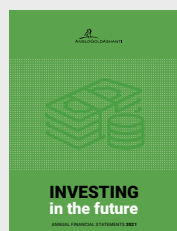
<AFS> Annual Financial Statements