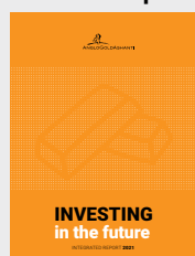
<IR> Integrated Report