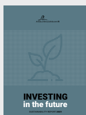
<SR> Sustainability Report