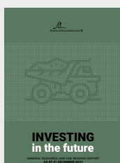
<R&R> Mineral Resource and Ore Reserve Report