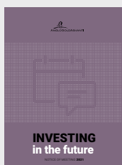
<NOM> Notice of Annual General Meeting and Summarised Financial Information (Notice of Meeting)